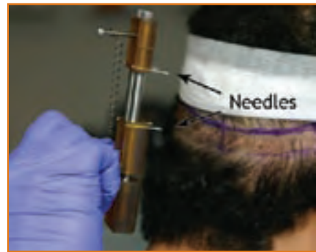
Figure 4. Intraoperative use of laxometer

We have started to use the laxometer routinely on almost all patients; however, we continued to seek a method to decrease human error in measuring the laxity. Thus, we equipped the laxometer with a spring to provide a constant pulling force instead of the surgeon’s hand pulling the pads. The two pads were attached to the skin with fixed needles (Figure 4) to eliminate slipping of the pads on scalp skin. Obviously, this method should be performed after applying