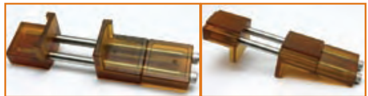
Figure 1. Laxometer

The laxometer can provide a metric for measurement of the laxity of the donor wound before surgery when planning a procedure, and a variation of this same instrument can be used to estimate tension on the wound during the hair transplant while local anesthesia is applied and before strip removal.